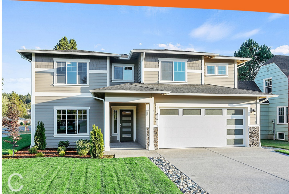
*GARAGE AND OTHER EXTERIOR FEATURES MAY NOT BE THE STANDARD DESIGN IN YOUR COMMUNITY AND ARE SUBJECT TO CHANGE

SPACIOUS ENTRY, FORMAL DINING ROOM, GREAT ROOM, DEN/STUDY ON MAIN, 5TH BEDROOM OR BONUS ROOM UPSTAIRS