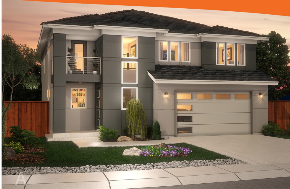
*GARAGE AND OTHER EXTERIOR FEATURES MAY NOT BE STANDARD IN ALL COMMUNITIES AND ARE SUBJECT TO CHANGE

DEN ON MAIN FLOOR, LARGE OUTDOOR LIVING AREA, LOFT, SPACIOUS MASTER SUITE, 2ND STORY COVERED DECK AREA